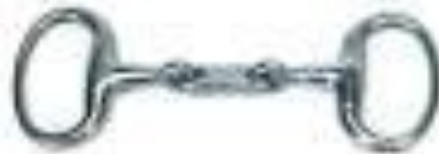
French Link snaffle

Types of covering for the mouthpiece may include copper, nylon, rubber, stainless steel and nickel.