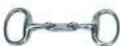
French Link snaffle