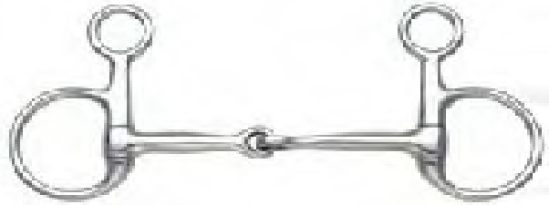
Baucher snaffle – hanging cheek