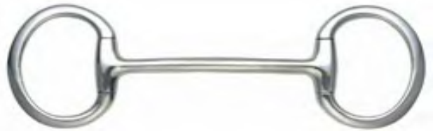
Mullen mouth snaffle