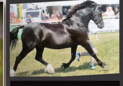
Pondarosa Welsh D Stud,Exeter Sponsered by Alvahorse and Welsh cob shop for all your needs to shine in the ring from products to in hand tack and clothing

Alvahorse Products enhances natural beauty, contact 07894044010 to order