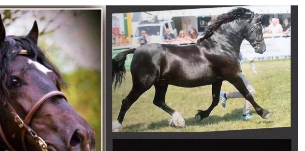
Pondarosa Welsh D Stud,Exeter Sponsered by Alvahorse and Welsh cob shop for all your needs to shine in the ring from products to in hand tack and clothing

The Champion & Reserve Champion from this Mountain & Moorland In-Hand section will qualify for the 2018 SWPA Supreme In-Hand Championship. To be held at the SWPA Championship Show on 31st August 2018.