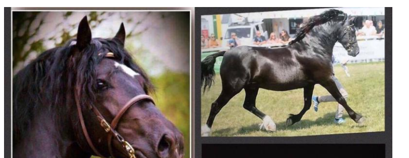
Pondarosa Welsh D Stud,Exeter Sponsered by Alvahorse and Welsh cob shop for all your needs to shine in the ring from products to in hand tack and clothing

The Champion & Reserve Champion from this Mountain & Moorland In-Hand section will qualify for the 2017 SWPA Supreme In-Hand Championship. To be held at the SWPA Championship Show on 1sr September 2017.