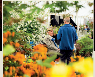
Crafts & Gardens

The Devon County Show is back! Join us for a Celebration of the Cream of the Devon countryside at Westpoint, Exeter