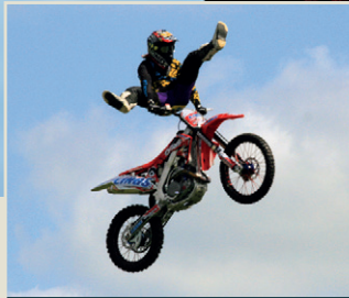
Bolddogs FMX team