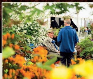
Crafts & Gardens

The Devon County Show is back! Join us for a Celebration of the Cream of the Devon countryside at Westpoint, Exeter