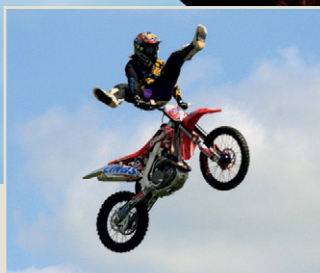
Bolddogs FMX team