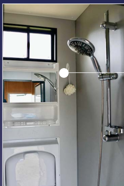
Bespoke partitions custom made to suit your requirements...