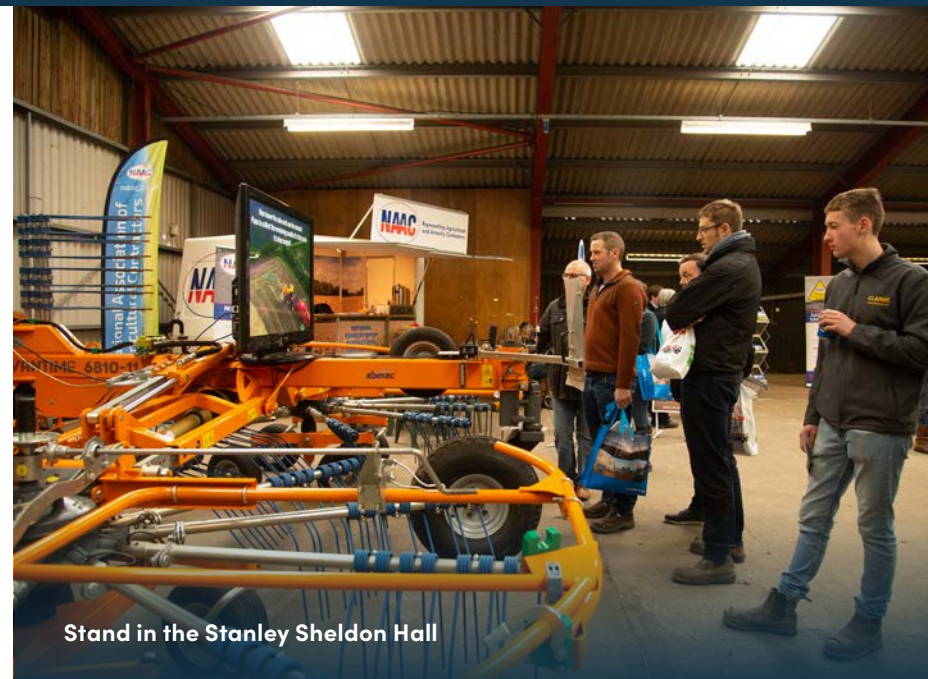
Stand in the Stanley Sheldon Hall