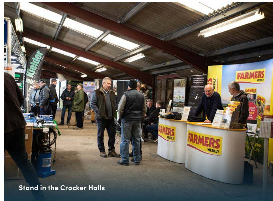
Stand in the Crocker Halls