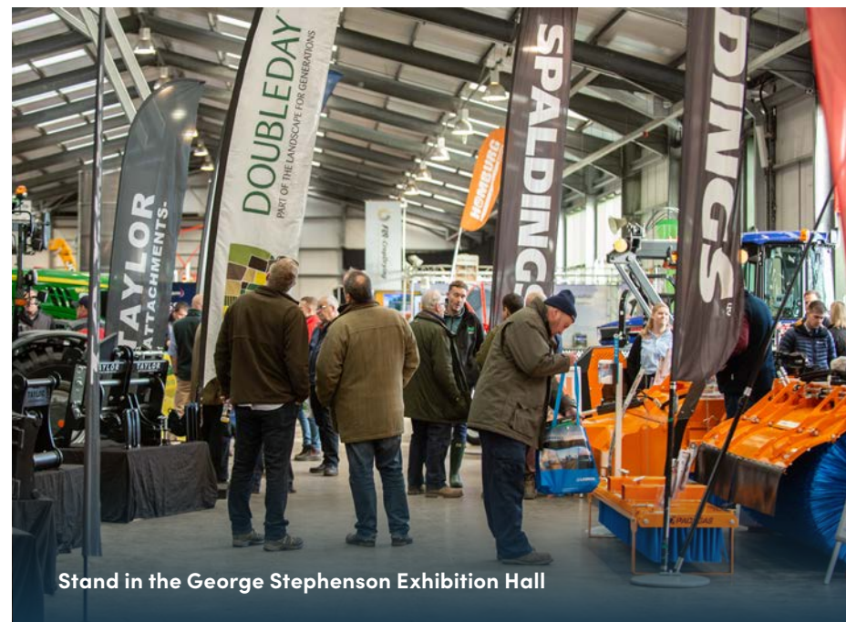
Stand in the George Stephenson Exhibition Hall