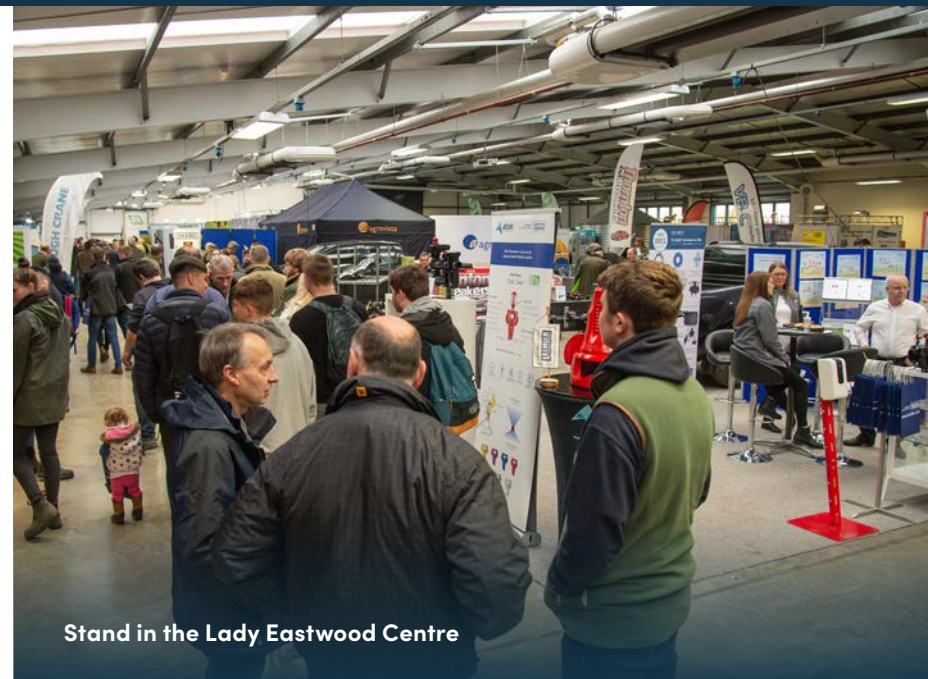
Stand in the Lady Eastwood Centre

Well organised and very good set up with good location and very genuine people, both farmers and traders. - Thornton Breakers