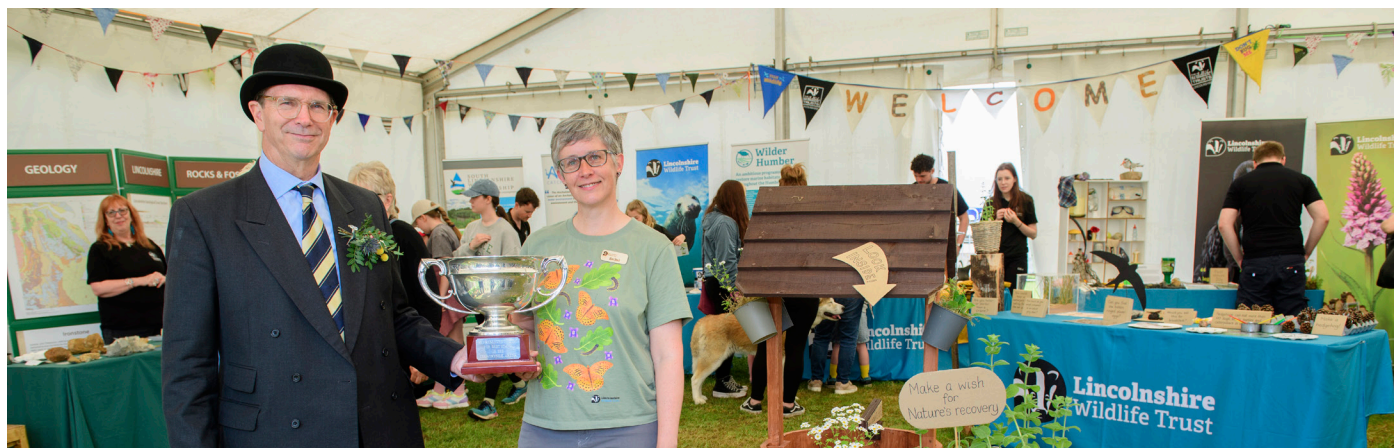
THE WITHAM GROUP CUP

For the best Trade Stand or Exhibit in the Show selected from the winners of classes T1 to T14. Judged by the President of the Society.