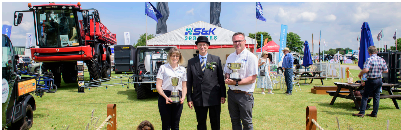
THE HUGH BOURN TROPHY