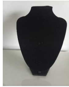
Illustration black stand Class 11

Sketch Class 9 Individual mesh squares 5cm Mesh measures 40cm wide, 60cm high on stand 170cm overall.